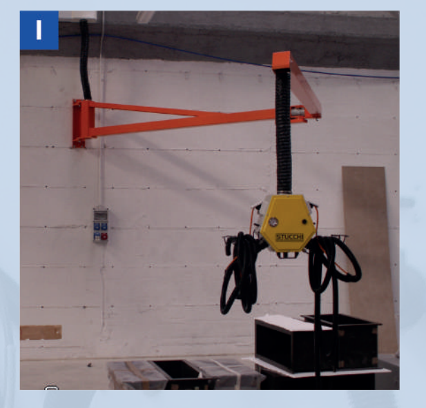
THE HEXAGON-SHAPED SERVICE CONTROL UNIT IS THE IDEAL PRODUCT AS A TERMINAL OF THE ARTICULATED ARMS (I) BUT ALSO AS A PENDANT SATELLITE (2) AND FOR THE INSTALLATION IN WALL (3).