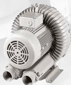
TKW15 1,5 kW